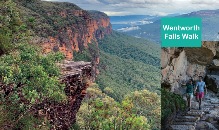
Wentworth Falls Walk

Fill your day your way with sightseeing, charming village strolls, and cosy dining plus your choice of activities.