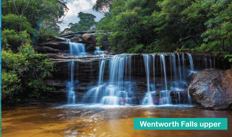
Wentworth Falls upper